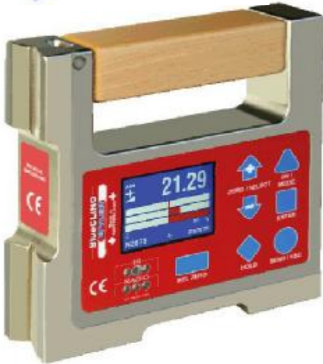
BlueCLINO with cast iron housing